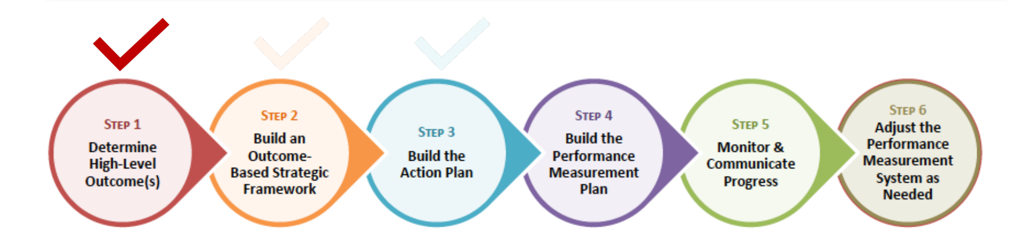
Figure 1. Process from Determining the High-Level Outcome to Implementing the Performance Management System.